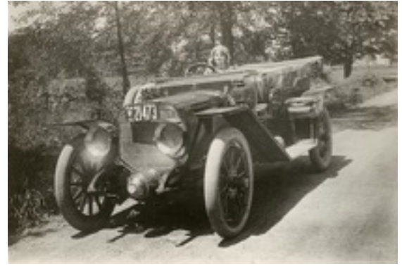
FLORENCE LAWRENCE SITS BEHIND THE WHEEL OF A LOZIER OPEN TOURING CAR WITH 1912 PENNSYLVANIA LICENSE PLATES.

Delving headfirst into the world of the automobile, Florence sought to learn all she could about the vehicle's various mechanisms in between enthusiastic drives. She became so invested in the relationship between driver and car that at one point she reportedly described her vehicle as "almost human"—something that, in her words, responded "to kindness and understanding and care, just as people do." This love for the automobile led Lawrence to explore additional safety measures to ensure the vehicle's continued practical use.