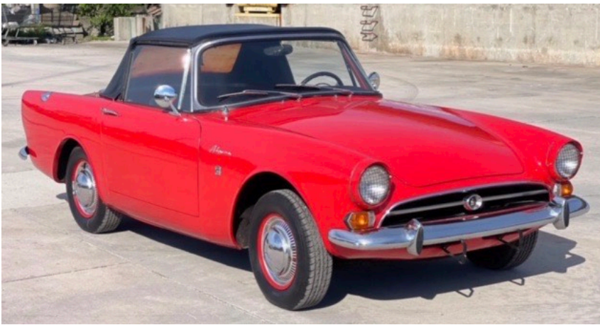
Alpine Mk IV

and was sold to the Rootes brothers. Although Rootes intended to continue the Sunbeam name, subsequent mergers caused the marque to be called Sunbeam-Talbot. When production resumed after WWII this was the name used on the new models.