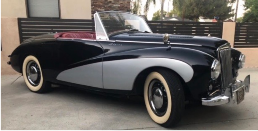
Alpine Mk I