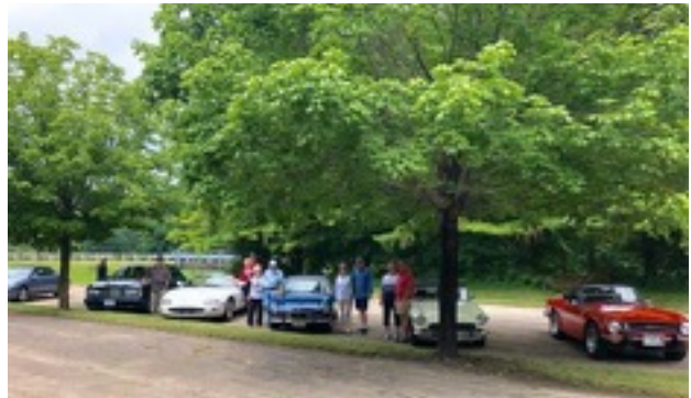
A quick stop at White Pines State Park.