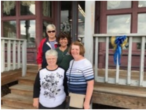
The gals outside of Country Floral and Gift Shop in Polo, adjacent to the "On Any Sunday" Motorcycle Museum.