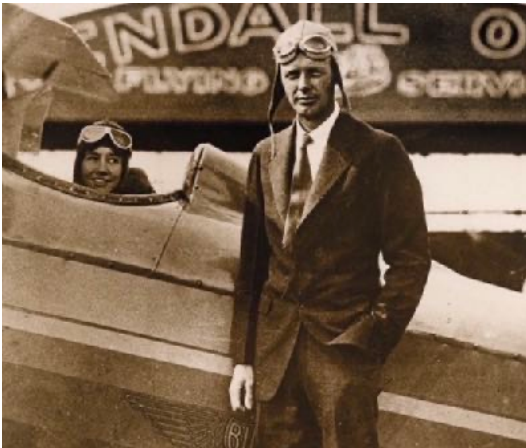
Lindy standing beside the airplane with Anne in the drivers seat

A priceless gem, and temporary star on display, is the Brunner-Winkle “Bird” biplane. Charles Lindbergh bought the plane in 1930 and registered it in his wife’s name. In it Anne Morrow Lindbergh learned to fly, earning her pilot's license in May 1931. The blue and yellow biplane has been expertly restored to the exact condition when owned by the Lindberghs, and is thought to be the only Lindbergh airplane in private hands.