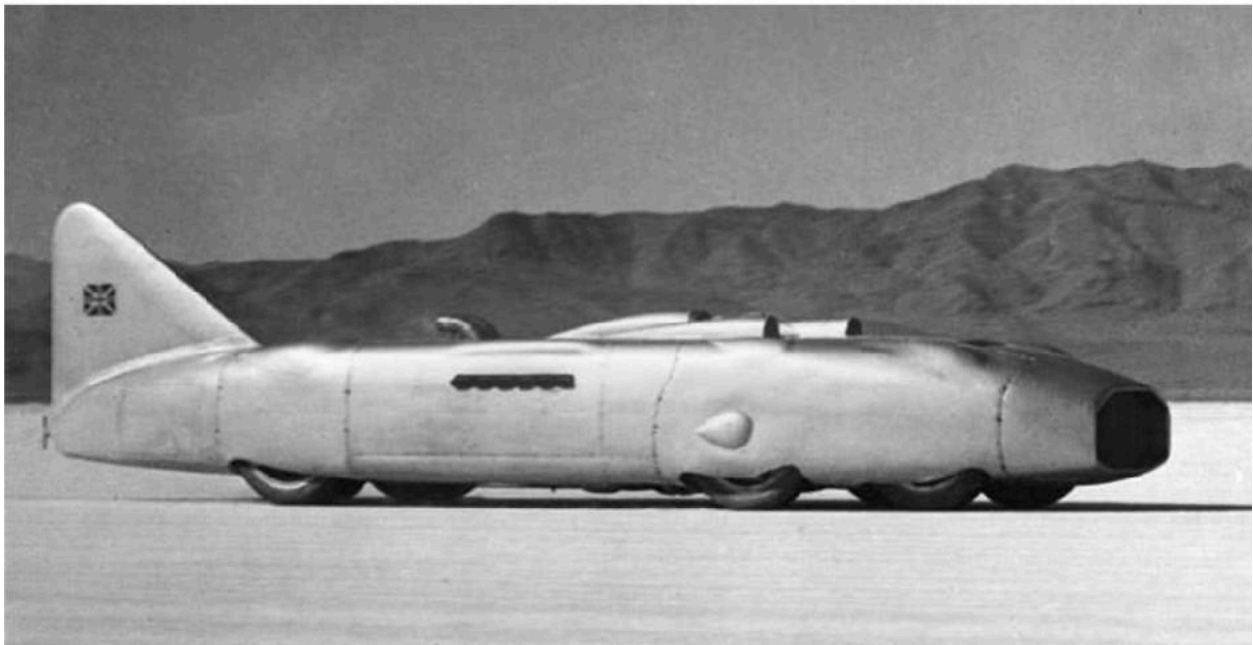
Land Speed Record