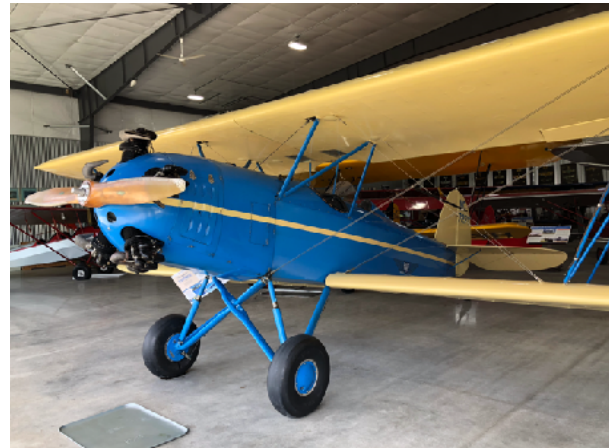
The Bird Biplane currently on display in Kelch Aviation Museum in Brodhead WI

As the afternoon progressed a brief shower sent some of our cars scurrying for shelter under the huge hangar door. Fortunately, it was short lived however and the sun soon returned allowing for a top-down drive as we headed home.