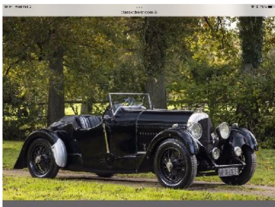
1927 Bentley 3 Litre Sports Two-Seater