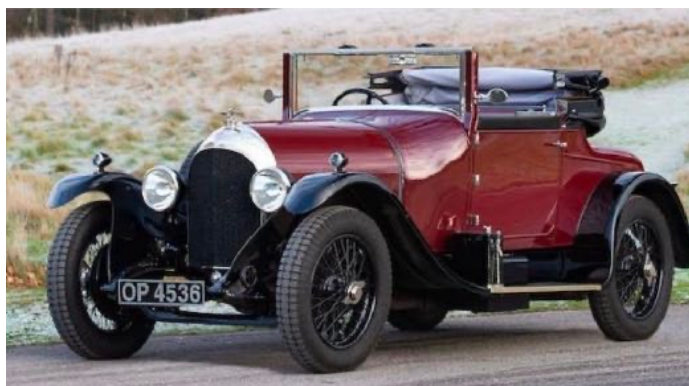
1926 Bentley 3 Litre Drophead Coupe

In 1922 a single 3L Bentley was entered in the Indianapolis 500 and it managed a respectable 13 th place finish in the 27-car field. Later that year three of the five cars to finish in the Isle of Man tourist trophy were Bentleys. As this was the only team to finish, they received the Team Award thereby launching Bentley's reputation. Bentley followed this up by winning Le Mans in 1924, 1927, 1928, 1929, and 1930. Ettore Bugatti is quoted to have said that W.O. "made the fastest lorries in the world".