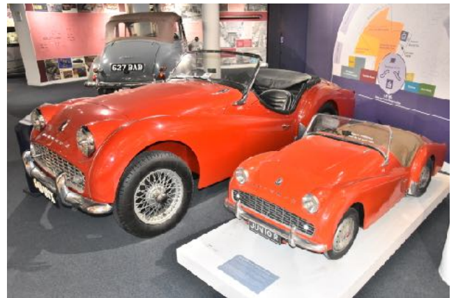
Triumph TR2 and model