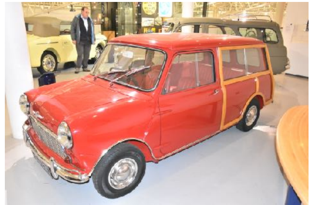
1965 Morris Mini Traveller