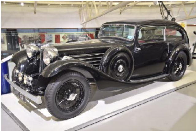
1935 SS Airline