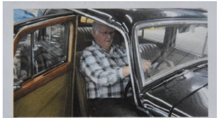
First time I sat in a SA since 1989

Having bought the car from an estate in Ohio just over three years ago the restoration goes on, as any car collector knows it's never quite done. However EBY 810 has made a good account of herself and received many awards. It is quite nostalgic to see pictures of EPH 216 in the British Motor Museum, the very car that started my SA journey.