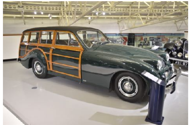
1953 Allard P2 Safari