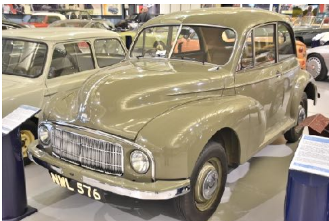
First Morris Minor produced