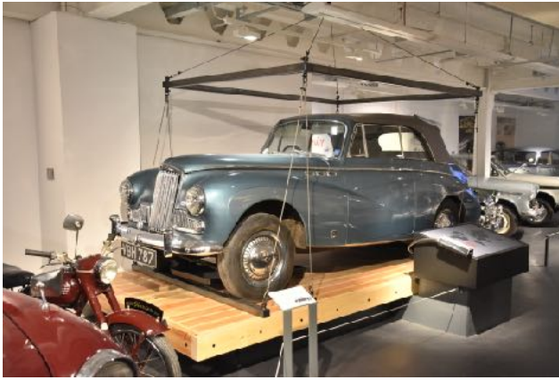
Sunbeam Rapier (showing ship loading method)