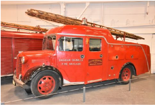
1939 Austin K2 Fire Engine