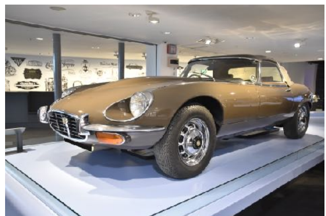
1974 V-12 Jaguar E-Type The entry display at Coventry Motor Museum