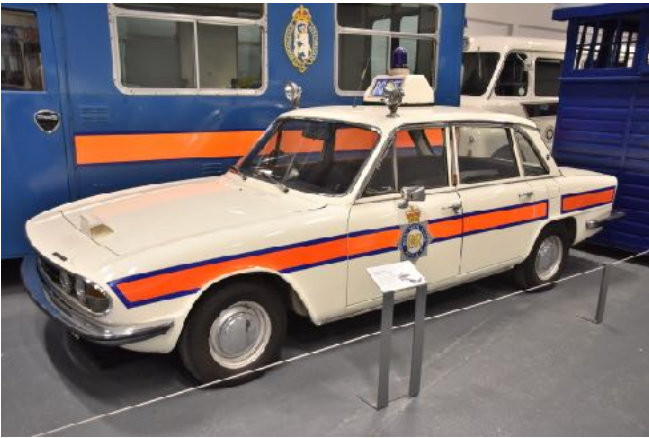
Triumph 2500TC Police Car