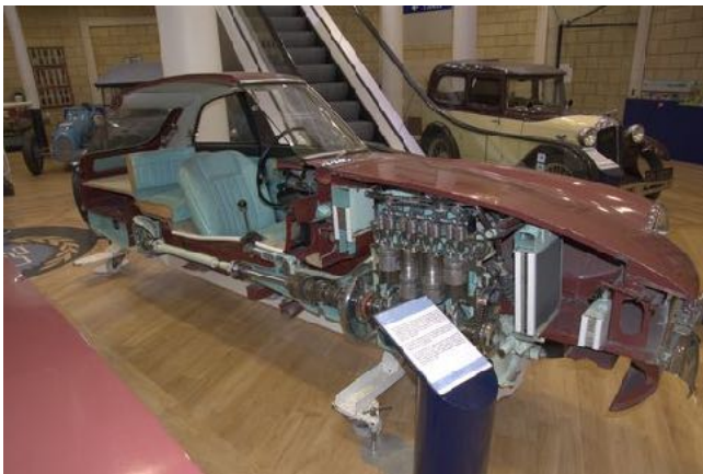
MGBGT “open for inspection”