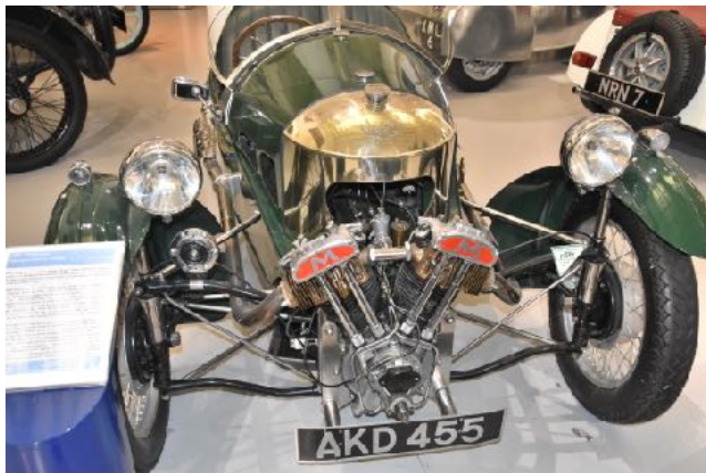
1935 Morgan 3 Wheeler

In November 2015 Roxann and I spent several days in central England. Two stops high on “our” list were the British Motor Museum in Gaydon and the Coventry Transport Museum in downtown Coventry. The British Motor Museum bills itself as “The world’s largest collection of historic British cars”. To say that these two museums are spectacular is a huge understatement! Perhaps one day you will have the pleasure of touring them in person. Until that can happen I hope you will enjoy these photos showing some of the finest offerings from the British Motor Industry. This is the second half of our photo selections. Enjoy! (If you missed the first half, please find them in the May 2020 Chronicle.)