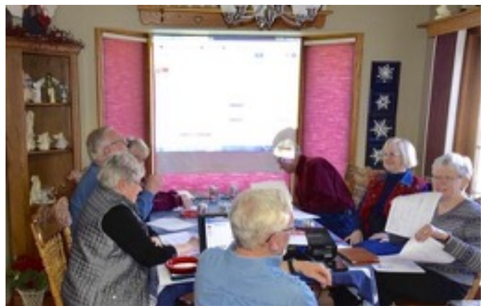
The Events Committee hard at work!