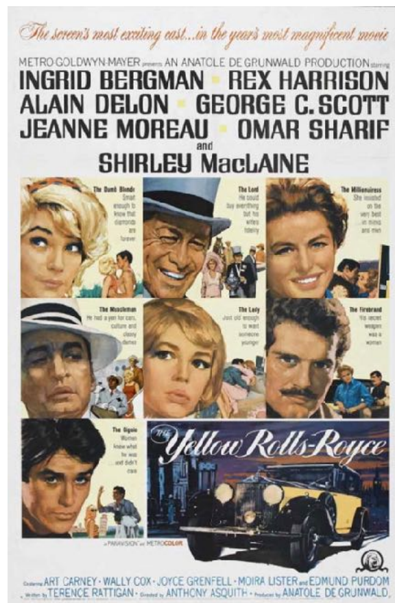
“The Yellow Rolls Royce” movie