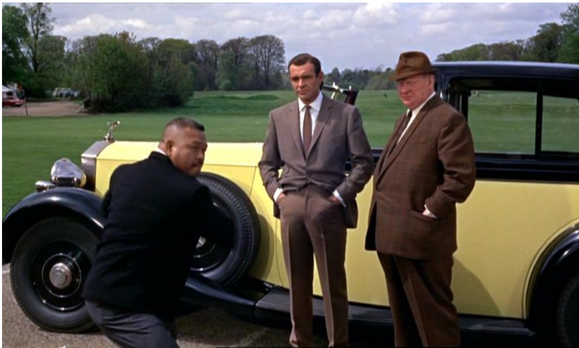
Phantom III Rolls Royce