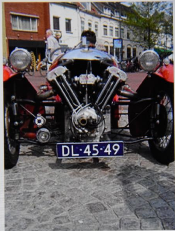
1934 Morgan Super Sport with JAP engine