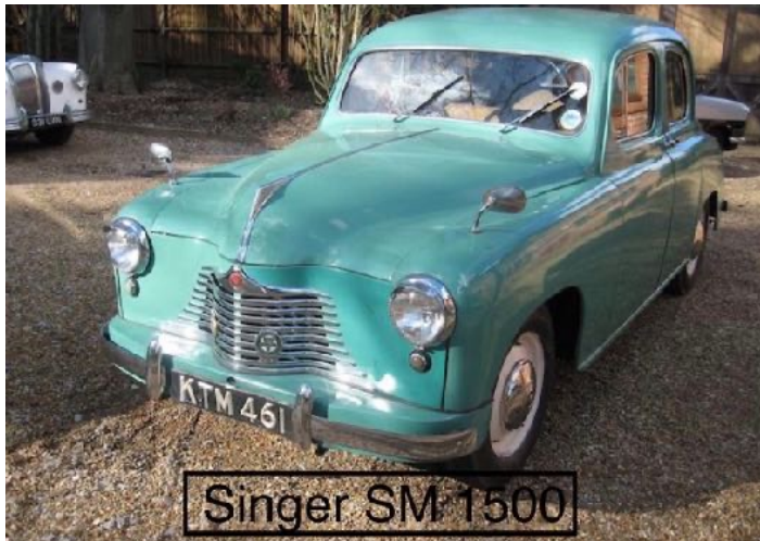
Singer SM 1500

The new car debuted in 1949 and is perhaps the best-known Singer in America, the SM 1500. Unfortunately, the chairman of the board of directors summed up the gloom on the horizon when he admitted the SM 1500 was built using “outdated