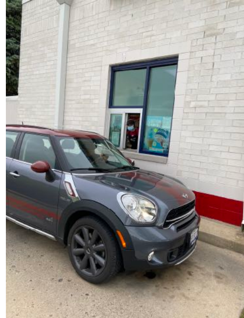
The Eils enjoyed DQ.