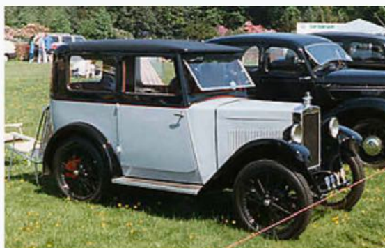
4-seat 2-door fabric saloon 1928

In 1927 William Morris bought the assets of Wolseley Motors Limited. At the time Wolseley were well into the development of an overhead camshaft 8hp car which Morris launched as the first Morris Minor in 1928. In 1929 he followed with the original MG Midget, based on the Minor's mechanicals.