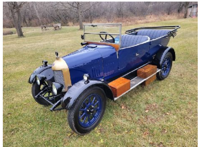
Bullnose - Old Number One was the first MG built to compete in sporting.